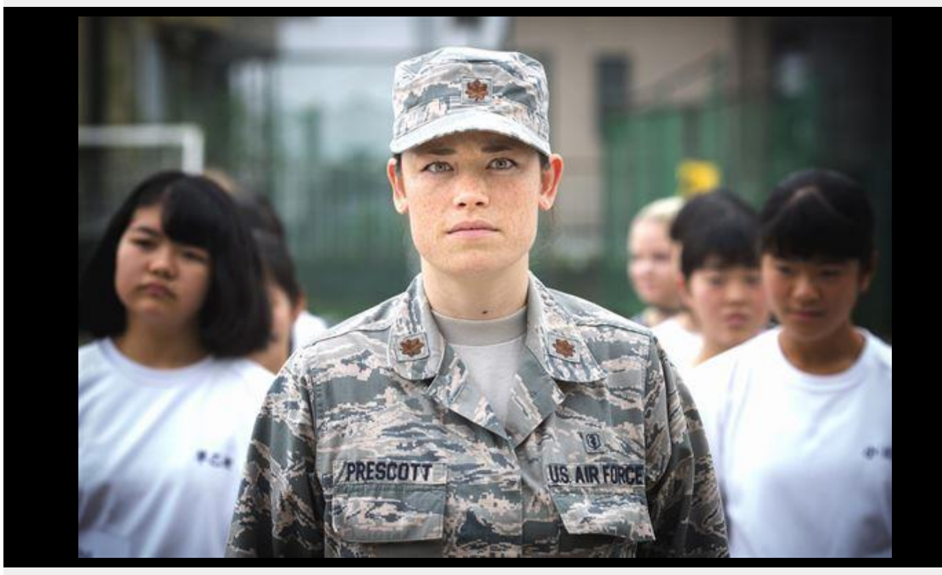
3 of 15